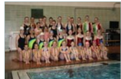
May 14, 2011 GSSC Water Show