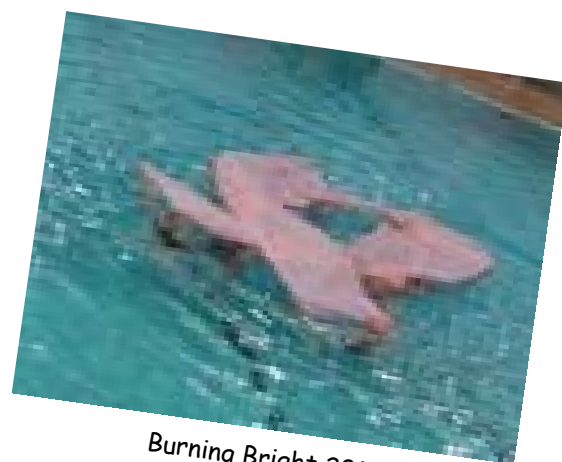
Burning Bright 2010