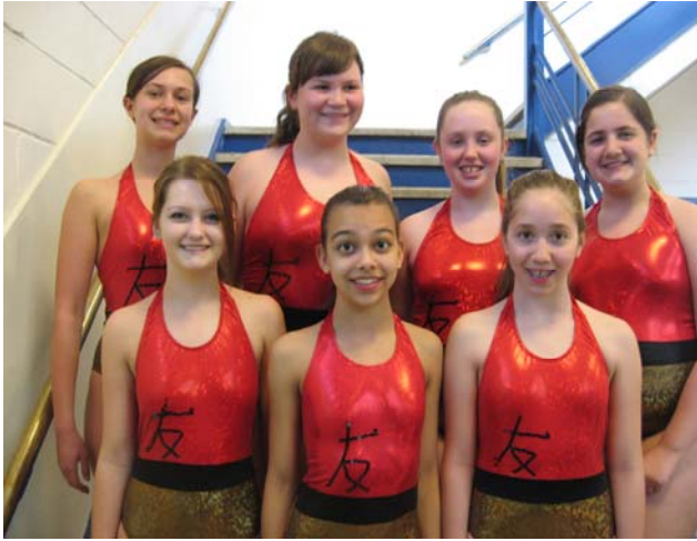
13-15 Developmental Team