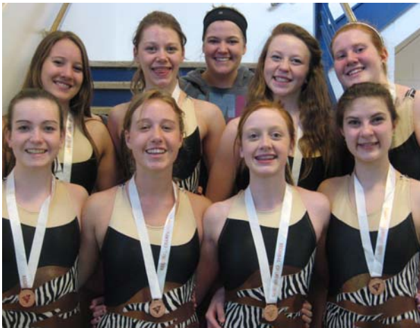
13-15 Competitive Team 3rd Place