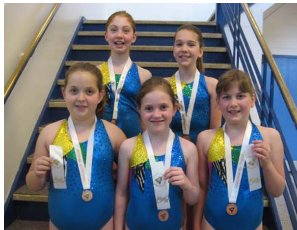
10&Under Competitive Team 3rd place